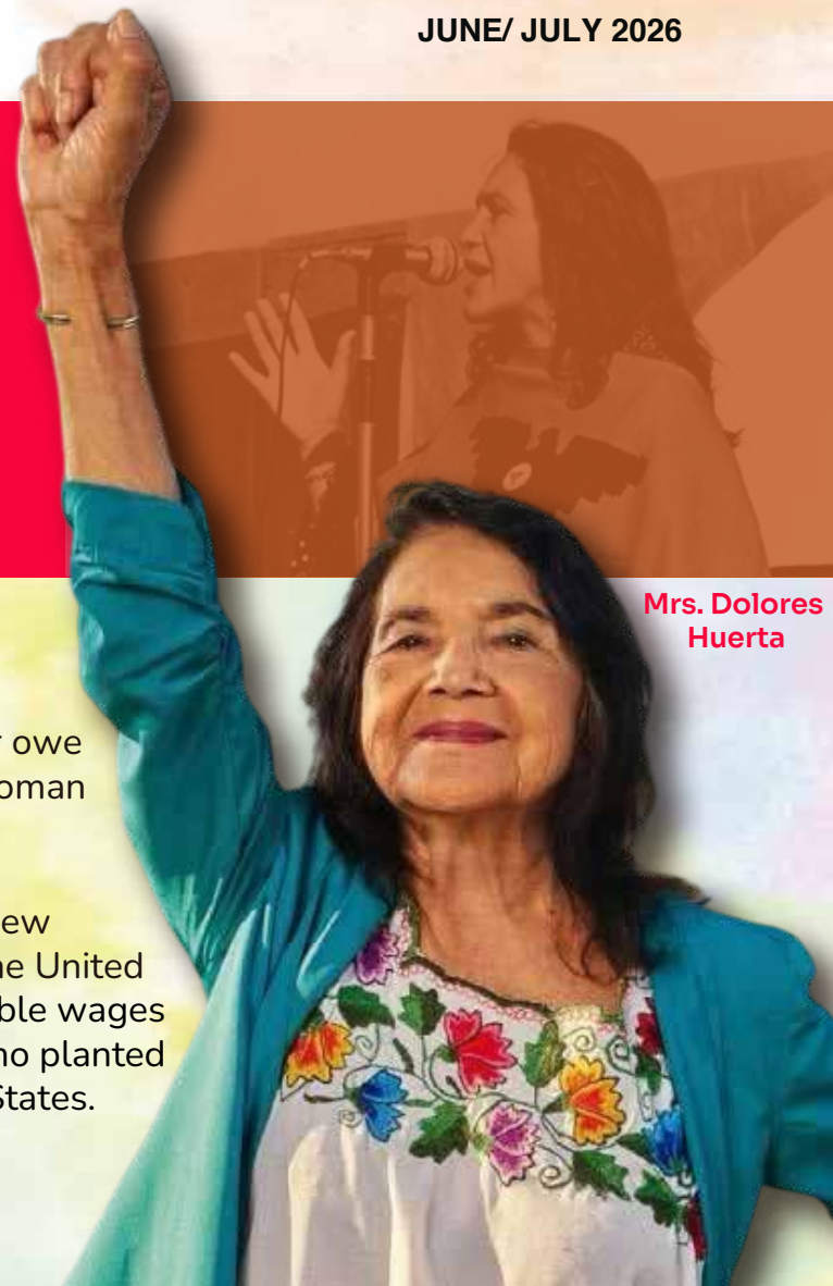
Mrs. Dolores Huerta

T he nearly two million people who work on American farms during the course of each year owe a tremendous debt of gratitude to a 95-year-old woman who many of them have never heard of, or met.