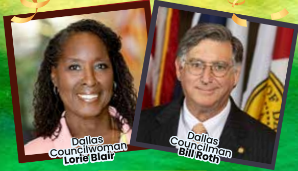
Please see page 5